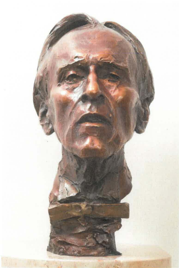
Claudio Abbado, created for the Berlin Philharmonic lobby