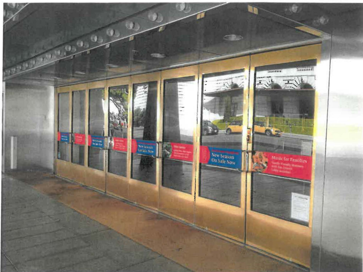
BOX OFFICE ENTRANCE