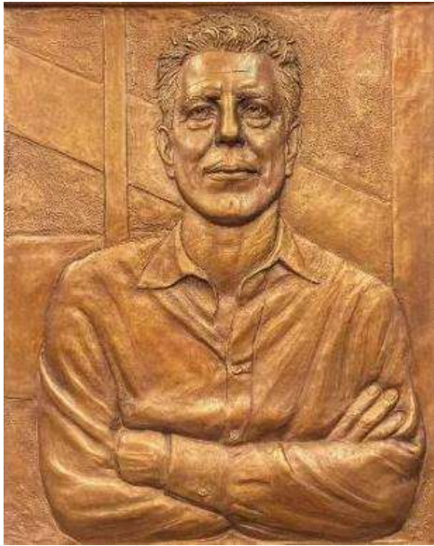
Anthony Bourdain Bas-Relief at the Culinary Institute of America (Hyde Park, NY 2019)